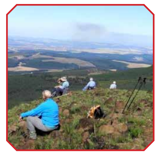
Our main area for hiking is predominantly the Midlands of KZN. The distances range from 8 - 18 kms some more demanding than others

If you are hiking for the first time try and choose a hike suited to your fitness level