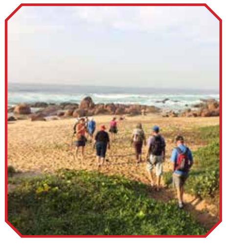
We do go further afield to the Drakensberg and the coast where we camp or stay in other accommodation