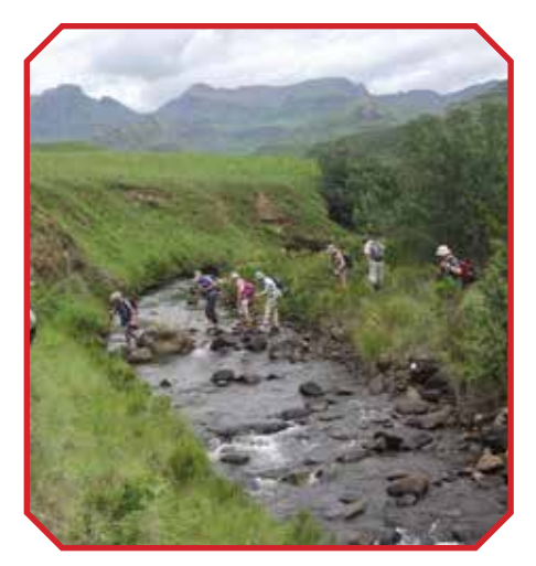
We do offer mountain backpacking but it is not our priority